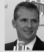
Urban Meyer 2012-present 61-6 (.910)