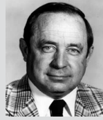
Earle Bruce 1979-1987 81-26-1 (.755)