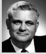
Woody Hayes 1951-1978 205-61-10 (.761)