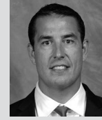
Luke Fickell 2011 6-7 (.462)