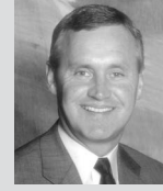
Jim Tressel 2001-2010 >94-21 (.817)