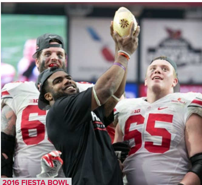
2016 FIESTA BOWL