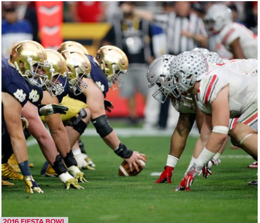
2016 FIESTA BOWL