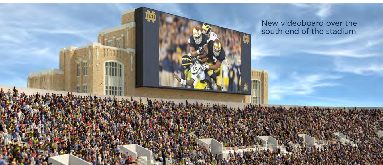
New videoboard over the south end of the stadium

“ JUST AS WE HAVE TAKEN GREAT PAINS THROUGH THIS RENOVATION PROCESS TO PRESERVE THE STADIUM BOWL THAT ROCKNE BUILT, WE HAVE BEEN EQUALLY DILIGENT IN PROTECTING HIS COMMITMENT TO MAKING SURE THAT NOTRE DAME FOOTBALL COULD BE ENJOYED BY EVERYONE. ”