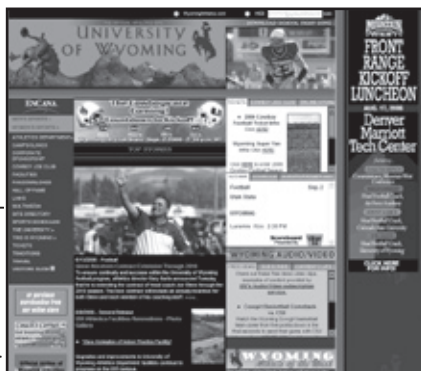
UW's Intercollegiate Athletic website is easily accessible at www.wyomingathletics.com