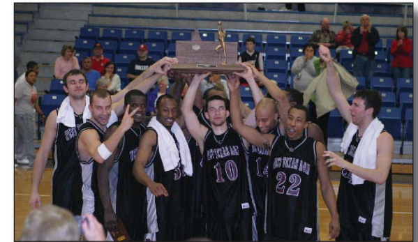
The Buffs took home the 2005-06 Lone Star Conference championship and followed up the accomplishment by capturing a co-LSC South Division Championship in 2006-07.