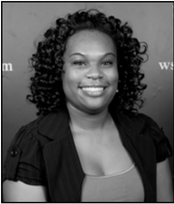
First Season Bachelor of Science Winston-Salem State, 2007