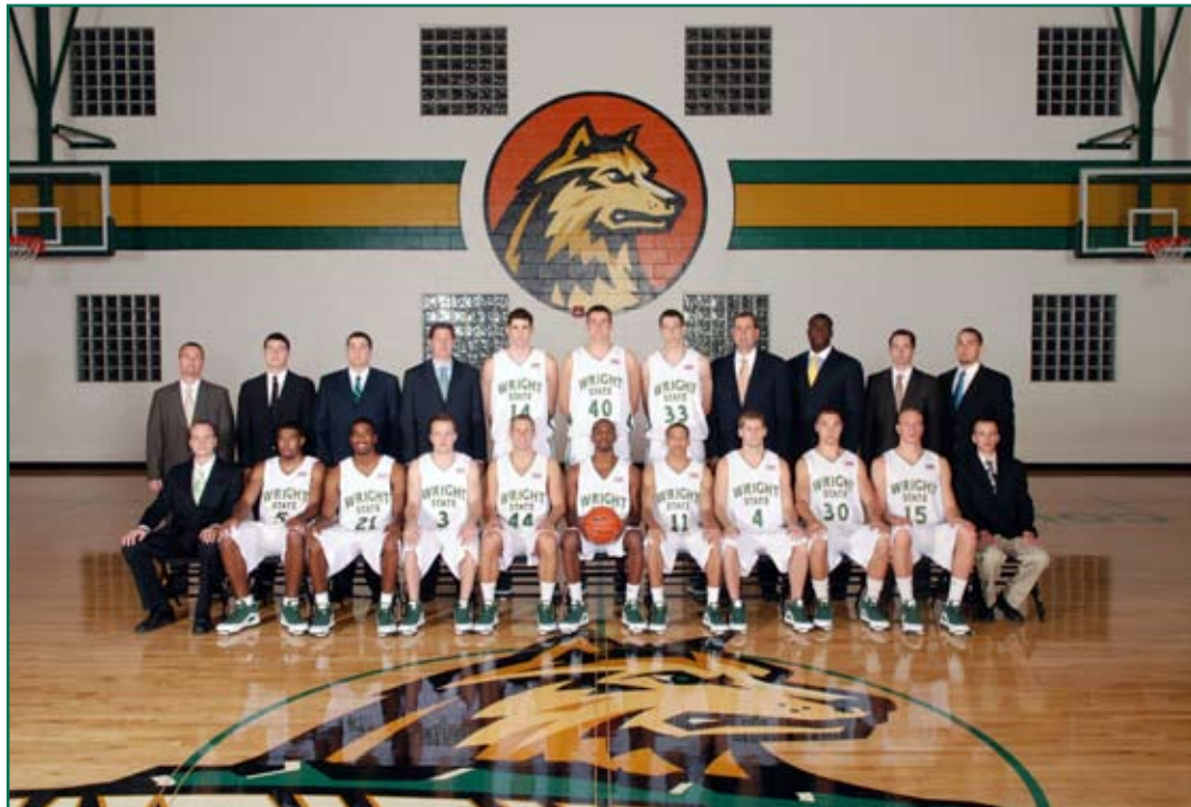
2008-09 Wright State Men’s Basketball