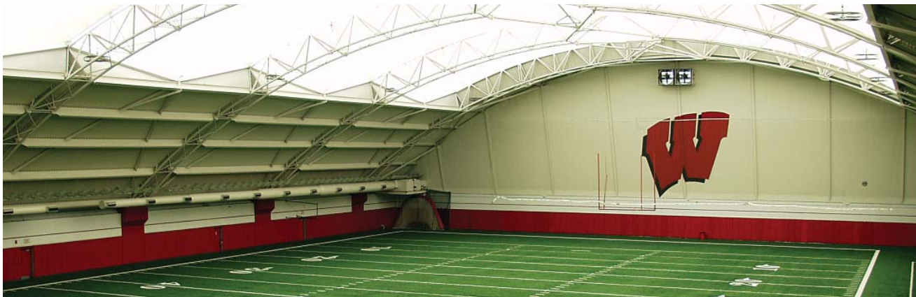
The McClain Center, which features an 80-yard indoor field, is an excellent training facility for both running and throwing.

By applying for this camp, I understand that the University of Wisconsin-Madison (UW) may take photographs and or videos of camp/clinic participants and activities. I agree that the UW shall be the owner of and may use such photographs and videos relating to the promotion of future camps. I relinquish all rights that I may claim in relation to the use of said photographs and videos.