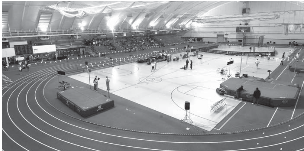
The Camp Randall Memorial Sports Center (The Shell) is the indoor home of the University of Wisconsin track and field teams.