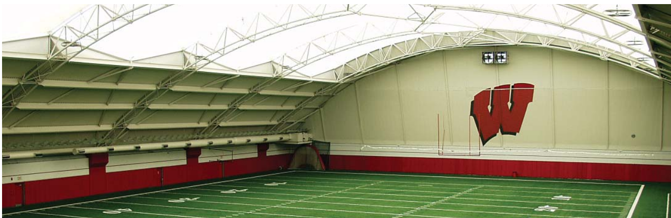
The McClain Center, which features an 80-yard indoor field, is an excellent training facility for both running and throwing.

By applying for this camp, I understand that the University of Wisconsin-Madison (UW) may take photographs and or videos of camp/clinic participants and activities. I agree that the UW shall be the owner of and may use such photographs and videos relating to the promotion of future camps. I relinquish all rights that I may claim in relation to the use of said photographs and videos.