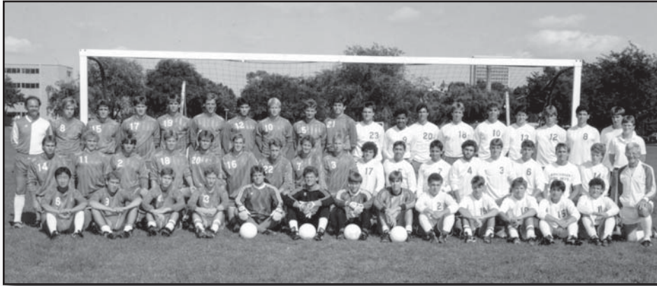
The 1986 Badgers set a then-school record of 51 goals scored in one season. They were the first (and one of just two) UW team to score 50 goals.