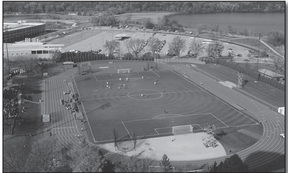
The Dan McClimon Memorial Track and Soccer Complex with Lake Mendota in the background.