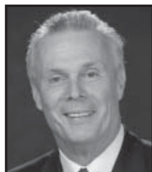
Bo Ryan Head Coach 12th season at UW