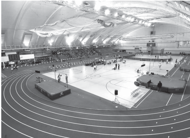
The Camp Randall Memorial Sports Center (The Shell) is the indoor home of the University of Wisconsin track and field teams.