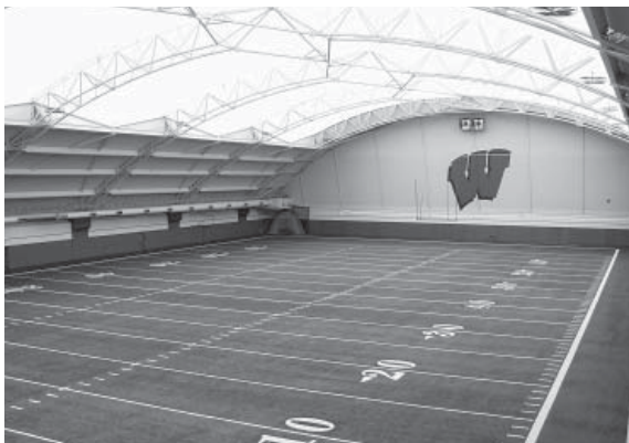
The McClain Center, which features an 80-yard indoor field, is an excellent training facility for both running and throwing.

Free parking is available in Lot 17, the ramp north of Camp Randall Stadium, or on the street.