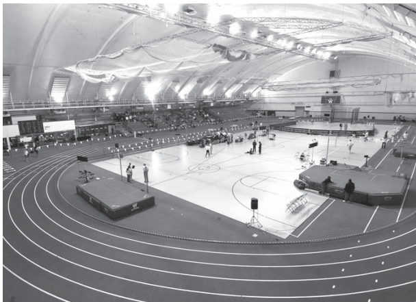
The Camp Randall Memorial Sports Center (The Shell) is the indoor home of the University of Wisconsin track and field teams.