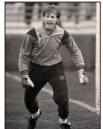
United States World Cup goalkeeper Kasey Keller led Portland to its first NCAA semifinal appearance as a freshman in 1988.

1974 San Francisco 5 , Chico State 2 UCLA 1, San Francisco 0 1973 San Francisco 5, Santa Clara 0 UCLA 3, San Francisco 2 1971 San Francisco 3 , San Jose State 2 San Francisco 6 , UCLA 2 St. Louis 3, San Francisco 2 § 1970 UCLA 3, San Francisco 2 1969 San Francisco 3 , Chico State 1 San Francisco 2 , San Diego State 2 San Francisco 3 , San Jose State 1 San Francisco 1 , Maryland 0 § St. Louis 4, San Francisco 0 F 1968 San Francisco 16 , Washington 0 Air Force 3, San Francisco 2 1967 San Francisco 1 , UCLA 0 San Jose State 3, San Francisco 3 1966 San Francisco 2 , San Jose State 1 San Francisco 2 , St. Louis 1 (OT) San Francisco 2 , Army 0 § San Francisco 5 , Long Island 2 F 1965 San Francisco 3 , Air Force 2 St. Louis 5, San Francisco 2 1963 St. Louis 3, San Francisco 2 (OT) 1961 St. Louis 1, San Francisco 0 1959 St. Louis 4, San Francisco 0 # Title vacated for use of ineligible player Ⓞ Game forfeited back to USF § NCAA Semifinal F NCAA Final