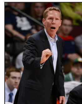
MARK FEW, GONZAGA 2017 AP National Coach of the Year

*Entering 2017-18 **Division III, 1989-90 (Cal Lutheran, 5 years; Division II Metro State 9 years = 328-105/758)