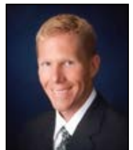
Mark Few Gonzaga Top Winning Percentage