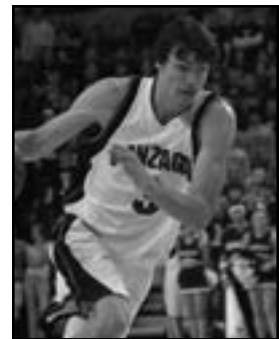
Adam Morrison Gonzaga