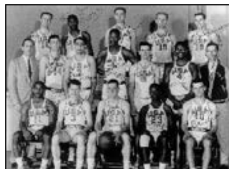
The 1955-56 USF squad went undefeated throughout the season going 29-0 on the way to the National Championship.

*Won playoff ;†Won WCC Tournament, ©Co-champions