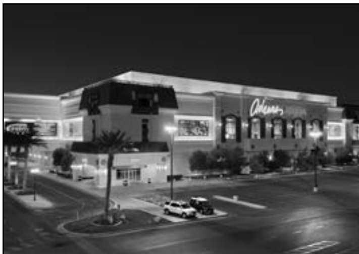
The Orleans Arena, in Las Vegas, will be the site of the 2012 Zappos.com West Coast Conference Basketball Championships.

Since opening its doors in 2003, the Orleans Arena has proven to be Las Vegas' favorite arena. The Orleans Arena seats 7,471 for basketball events, and is also the home of the ECHL's Las Vegas Wranglers professional hockey team.