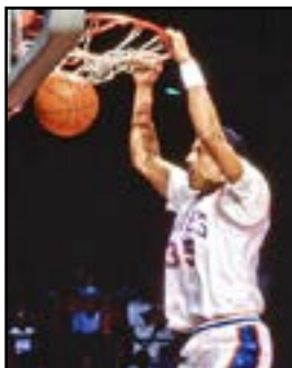
Doug Christie Pepperdine