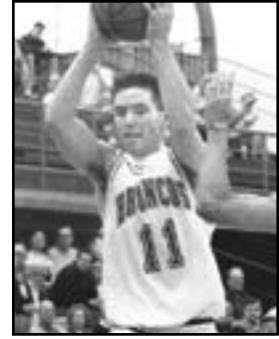
Steve Nash Santa Clara