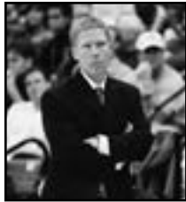
Mark Few, GON Nine-Time WCC Coach of the Year