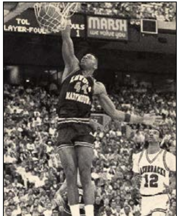
Hank Gathers of LMU led the nation in both scoring and rebounding as a junior in 1989 and is the WCC's all-time scoring leader.