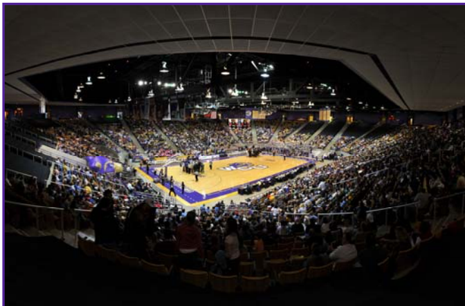
Liston B. Ramsey Regional Activity Center: The Home of Catamount Basketball

* The Advanced Skills Camp is open to any and all entrants (limited only by number, age, grade level and/or gender).