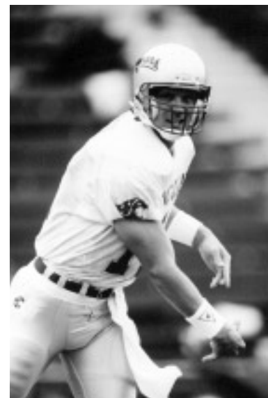
Drew Bledsoe was an All-American in 1992 while leading WSU to a Copper Bowl win.