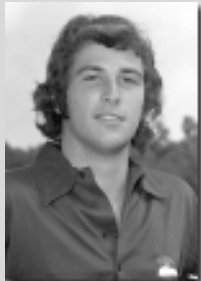
CURTIS STRANGE 1974