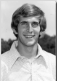
JAY HAAS 1975