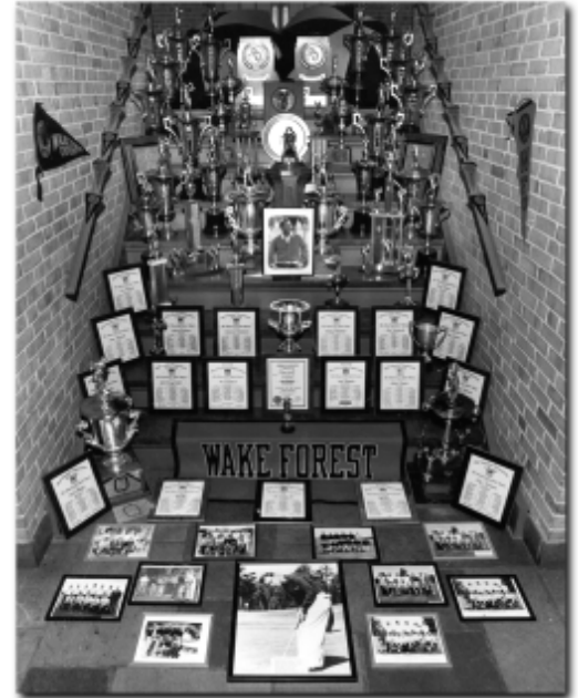
Wake Forest’s 1957 ACC Championship Team