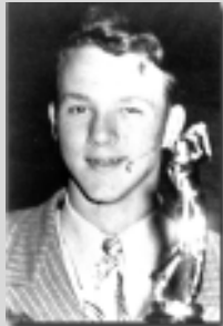
ARNOLD PALMER 1949, 1950