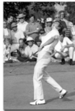
Jay Haas sinks the winning putt en route to the 1975 NCAA individual title.

* NCAA Regional finishes (missed cut). The NCAA began a regional playoff format in 1989.