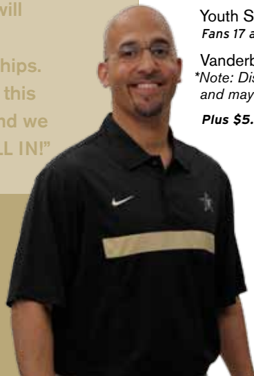
Head Coach James Franklin

"No part of this program will settle. Everything we do will be about championships. This administration is in, this coaching staff is all in, and we need everybody to be ALL IN!"