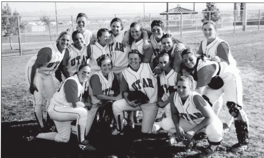
Utah's 2000 and 2001 (seen above) teams rank in the NCAA top 25 for team home runs in a season with 58 and 60, respectively.