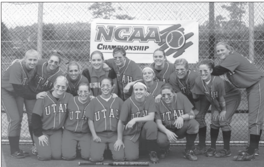
In 2000, the Utes won both the league's first conference regular-season and tournament titles.