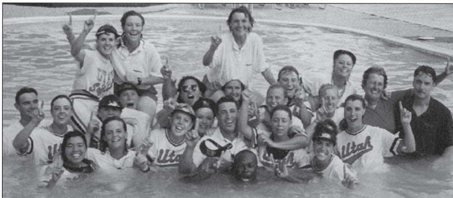
The Utes celebrate after defeating No. 2 Southwestern Louisiana, snapping the Ragin' Cajuns' 52-game home field win streak, and more importantly, sending Utah to the 1994 World Series.