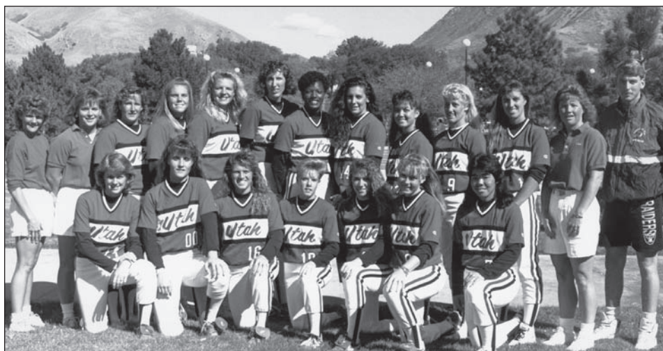
The 1990-1991 team reached the College World Series, held in Oklahoma City, Okla.