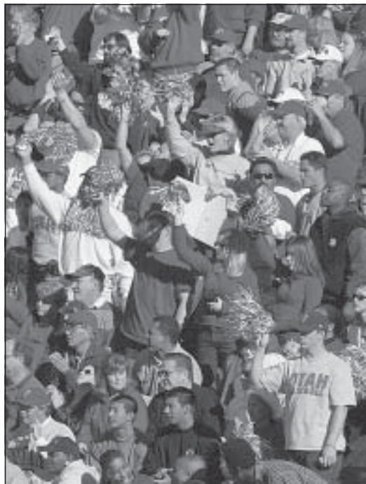
Utah fans have a reputation of traveling to watch their team at bowl games.

9-1 at Texas 9-8 at Oregon State 9-15 UCLA 9-29 Utah State MWC games TBA (3 home)