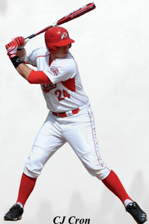
CJ Cron 17th Overall Pick- 2011 MLB Draft Los Angeles Angels of Anaheim