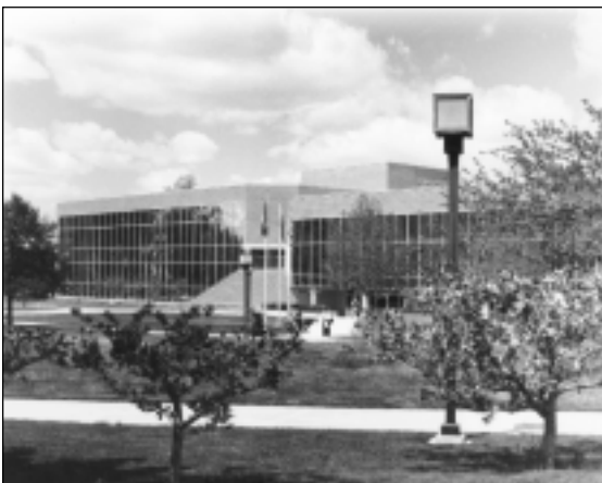
taggart STUDENT CENTER

Utah State includes eight resident colleges (Agriculture; Business; Education; Engineering; Family Life; Humanities, Arts and Social Sciences; Natural Resources; and Science) with 45 departments, a School of Graduate Studies, University Extension and research programs. There are also current programs in education aid to several foreign countries.