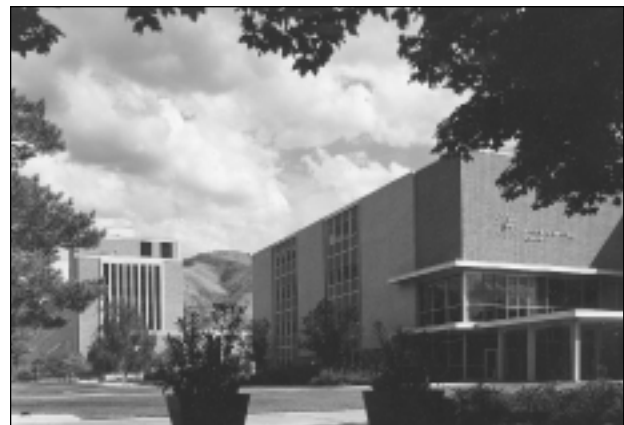
milton r. merrill LIBRARY