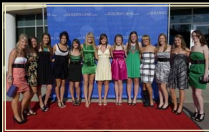
Left: Arriving on the Red Carpet

All in all, it was a night to remember for everyone in attendance. Without question, it was indeed a phenomenal display of the athletic, academic, and creative talents of all TU student-athletes.