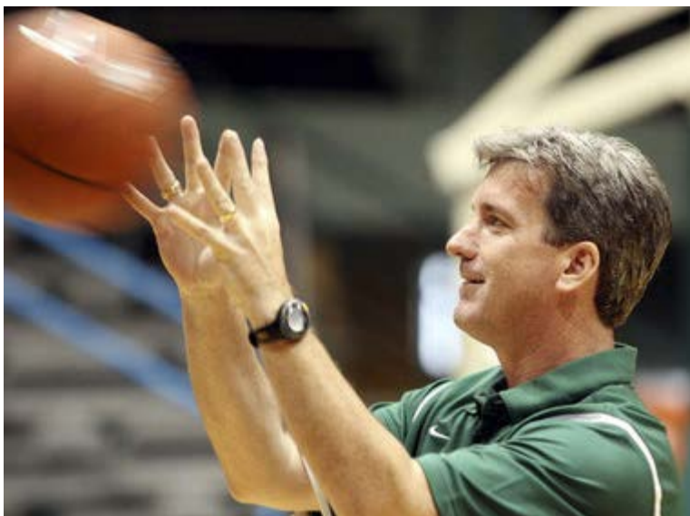
Eliot Kamenitz, The Times-Picayune

The second edition of Coach Ed Conroy's Tulane men's basketball team looks vastly different from the first one, even with the return of a key component.