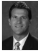
Steve Alford Head Coach

Possible Opponent - Hawkeye Challenge Saturday, December 3 • 5:45/8 p.m. Iowa City, Iowa