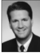
John Calipari Head Coach

Saturday, February 12 • 12 p.m. FedEx Forum