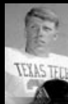
Denton Fox DB, 1969