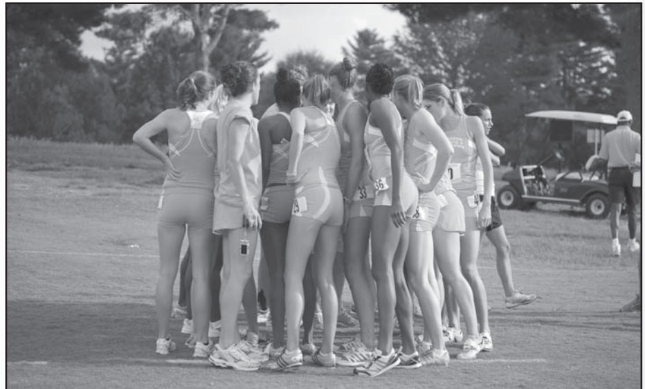
Since 2002, UT has amassed five NCAA Championship meet appearances, four NCAA South Region crowns, three SEC titles and a won-lost record of 723-195-1...and the beat goes on.