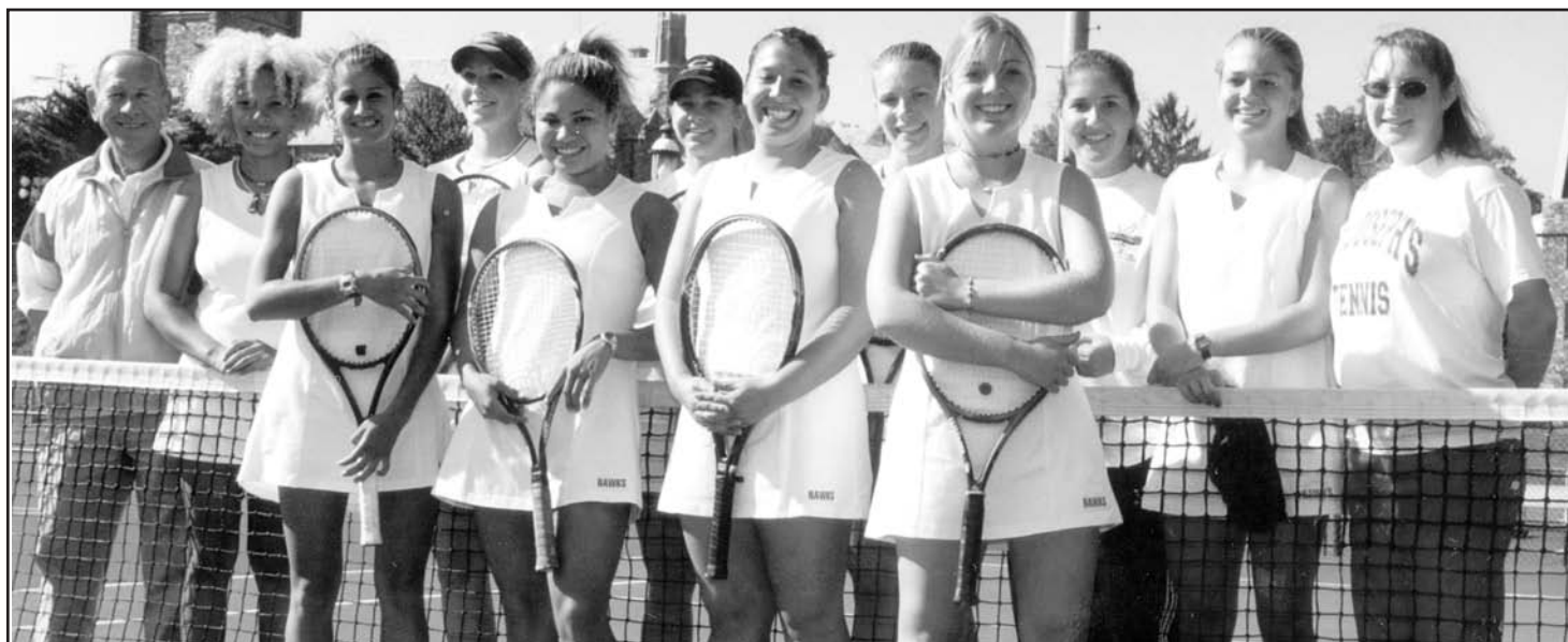
The 2000-01 Hawks are one of only three teams to post a 10-win season for Saint Joseph's. Stringing together six-straight victories that year, Saint Joseph's finished the season 10-6 overall and a tie for ninth at the Atlantic 10 Championships.