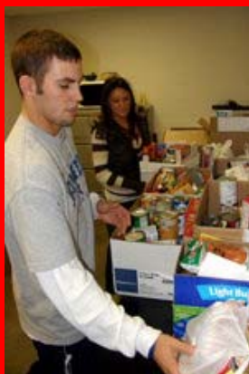
URI SAAC members prepare food baskets for the Johnnycakes Center (above), while Xavier's SAAC gets down and dirty during a bonding retreat (below)