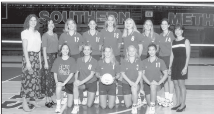
The 1997 SMU Volleyball Team