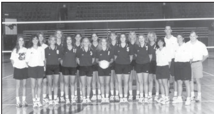
The 1996 SMU Volleyball Team