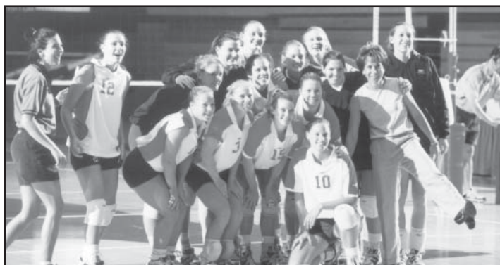
The 1999 SMU Volleyball Team

SMU posted its first winning record of 20-13 and nearly earned a spot in the NCAA Tournament in 1999. The Ponies won two of the four tournaments in which they played, including the SMU invitational, and led the WAC in team digs and assists per game, and in total kills, assists and digs.