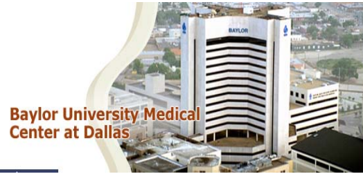
Baylor University Medical Center at Dallas