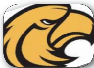
No. 9 Southern Miss Lady Eagles 12-17, 6-10 C-USA