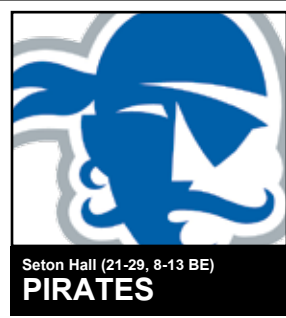
Seton Hall (21-29, 8-13 BE) PIRATES