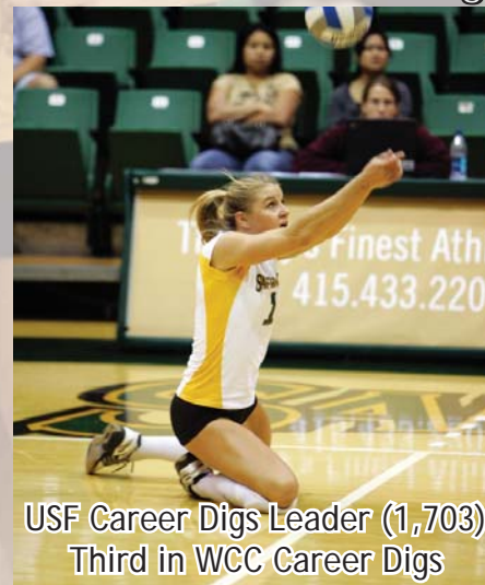
USF Career Digs Leader (1,703) Third in WCC Career Digs