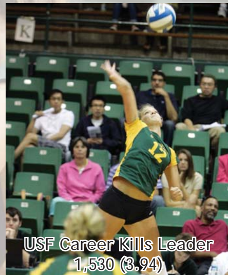
USF Career Kills Leader 1,530 (3.94)