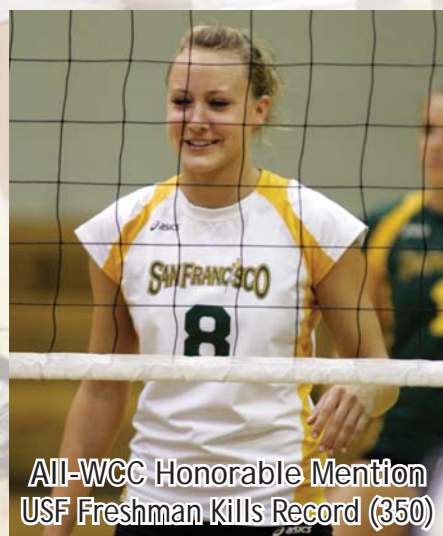
All-WCC Honorable Mention USF Freshman Kills Record (350)