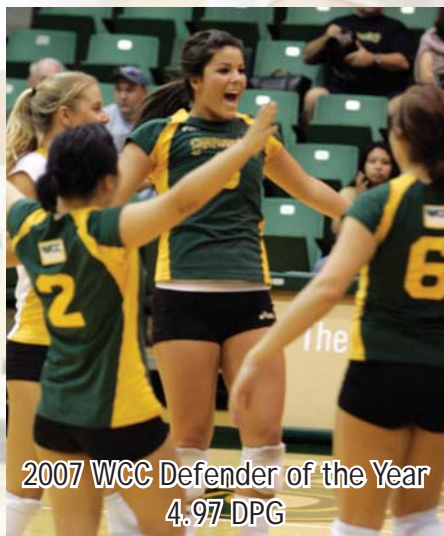
2007 WCC Defender of the Year 4.97-DPG