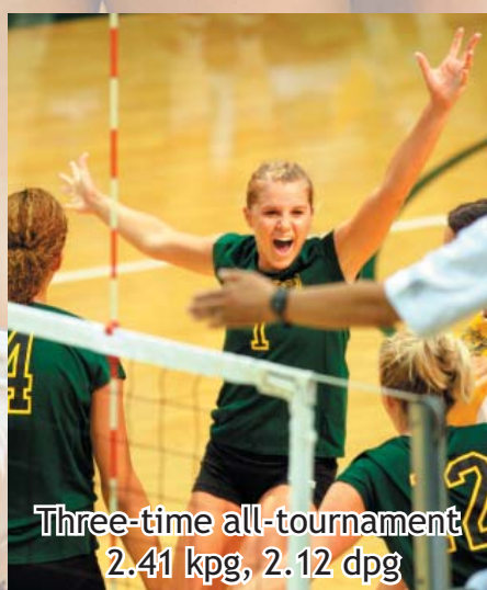
Three-time all-tournament 2.41 kpg, 2.12 dpg