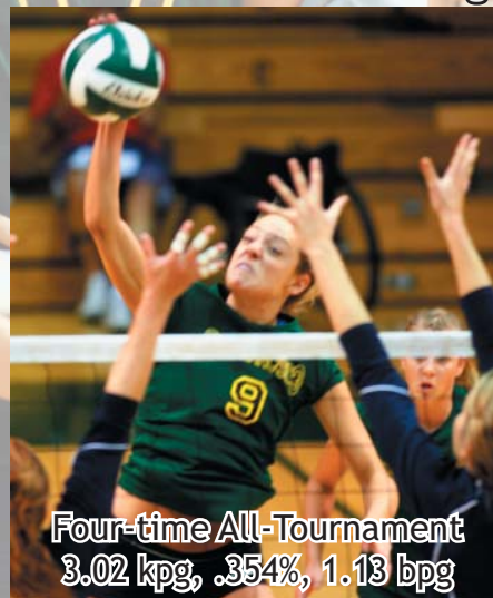
Four-time All-Tournament 3.02 kpg, .354%, 1.13 bpg