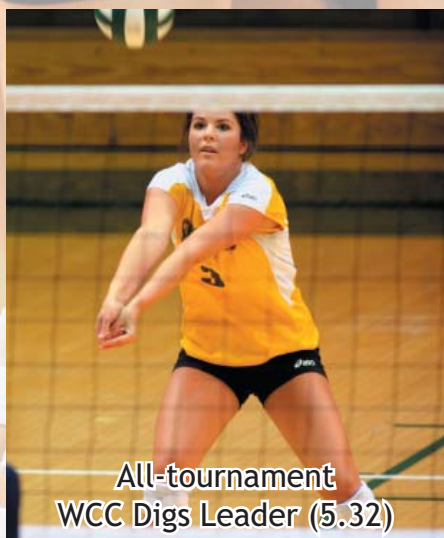
All-tournament WCC Digs Leader (5.32)