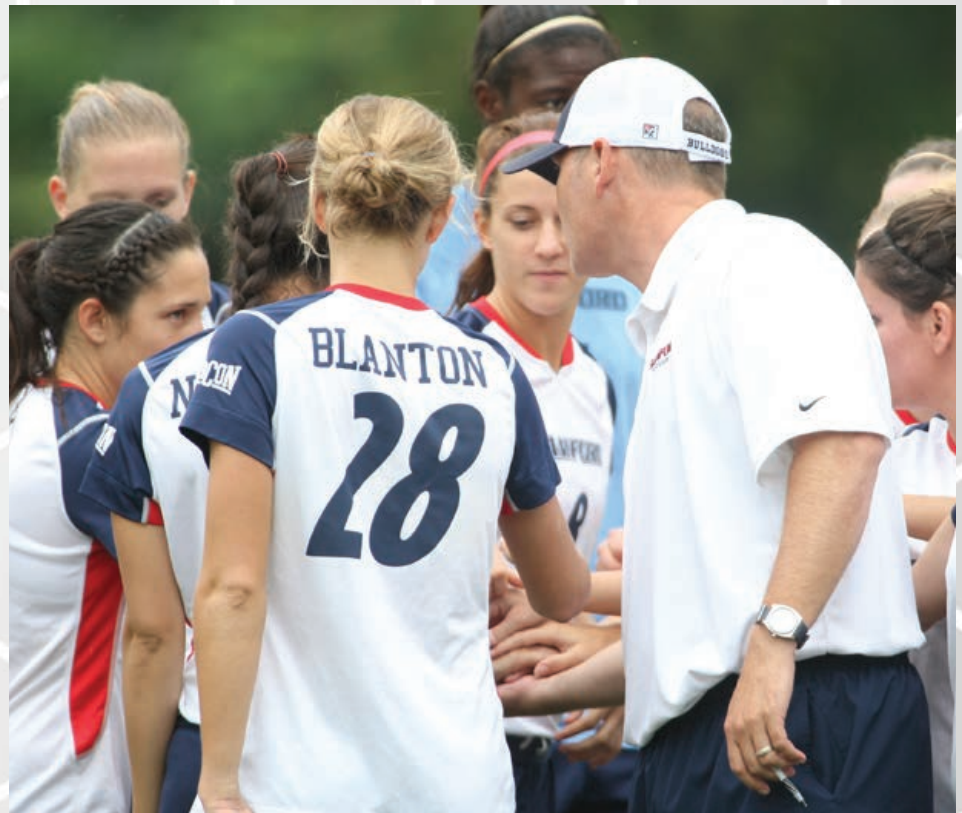
The Bulldogs huddle prior to a match in 2010.

The semifinal rounds of the 2011 SoCon Tournament will be held in Greensboro, N.C., at the UNC–Greensboro Soccer Stadium (3,540) Nov. 4–6. The opening round of the eight-team tournament will be held at the home facility of the higher-seeded teams. The winner of the event will earn an automatic berth in the NCAA Tournament.