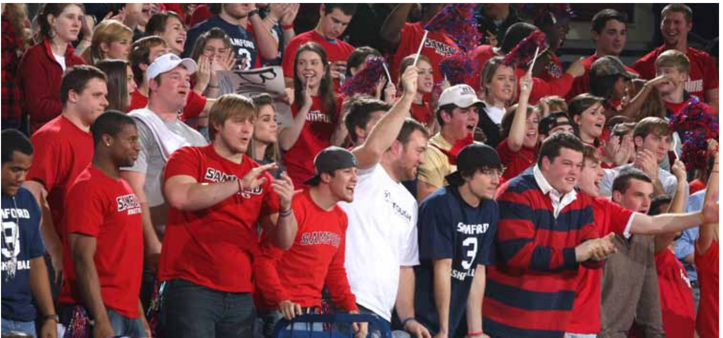
It was standing room only in the Samford student section for the Bulldogs' nationally televised game against the College of Charleston.