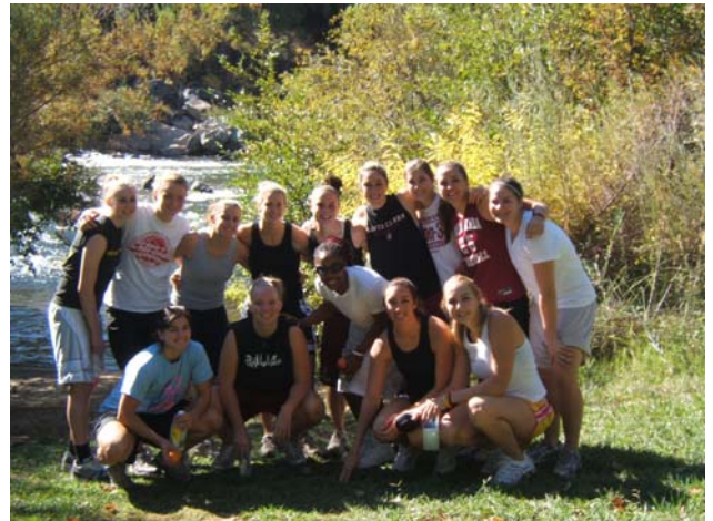
ABOVE: The Broncos gather for a group shot during their camping and ropes course bonding trip to Coloma in October.