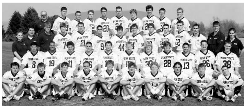
The 2003 Penn State Nittany Lions were the first team in school history to earn a spot in the NCAA Tournament.