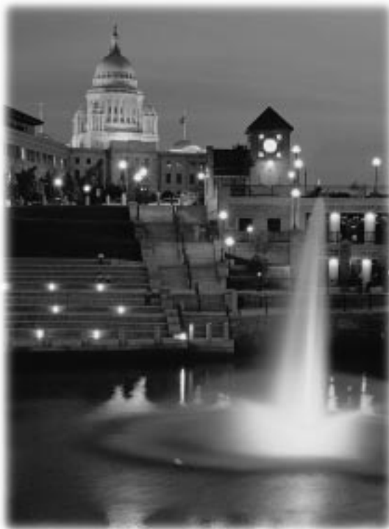
A glimpse of the famous state capitol building.

Make no mistake, as soon as you land at the airport or cross the state line, you are in FRIARTOWN. The state of Rhode Island is comprised of hard-working, family-oriented people who are Friar Fanatics.