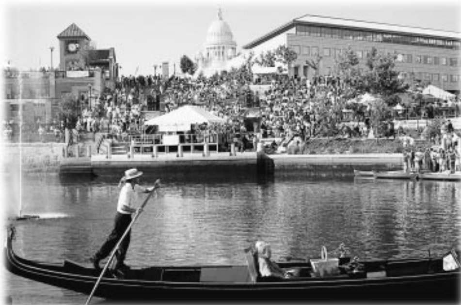
The scenic Providence River is one of the many attractions to be found in downtown Providence.