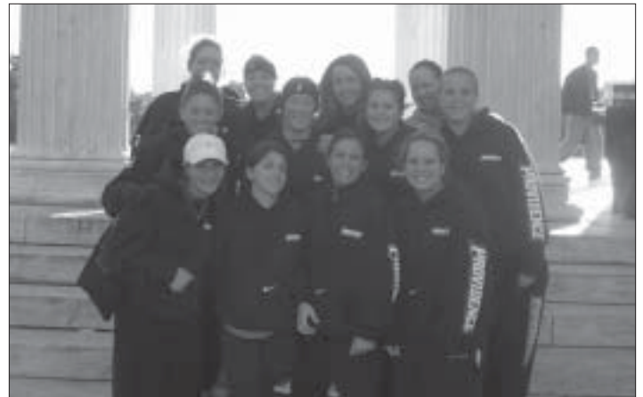
exhibit. As volunteers, the Friars helped with: greeting visitors at the festival, general assistance with live entertainment, supervision over the children's activity area, and the finalizing of sales for the tree and wreath exhibits.

shop items were donated and were eventually sold. This year all proceeds benefited the young children of the Rhode Island Zoological Society, specifically the polar bear