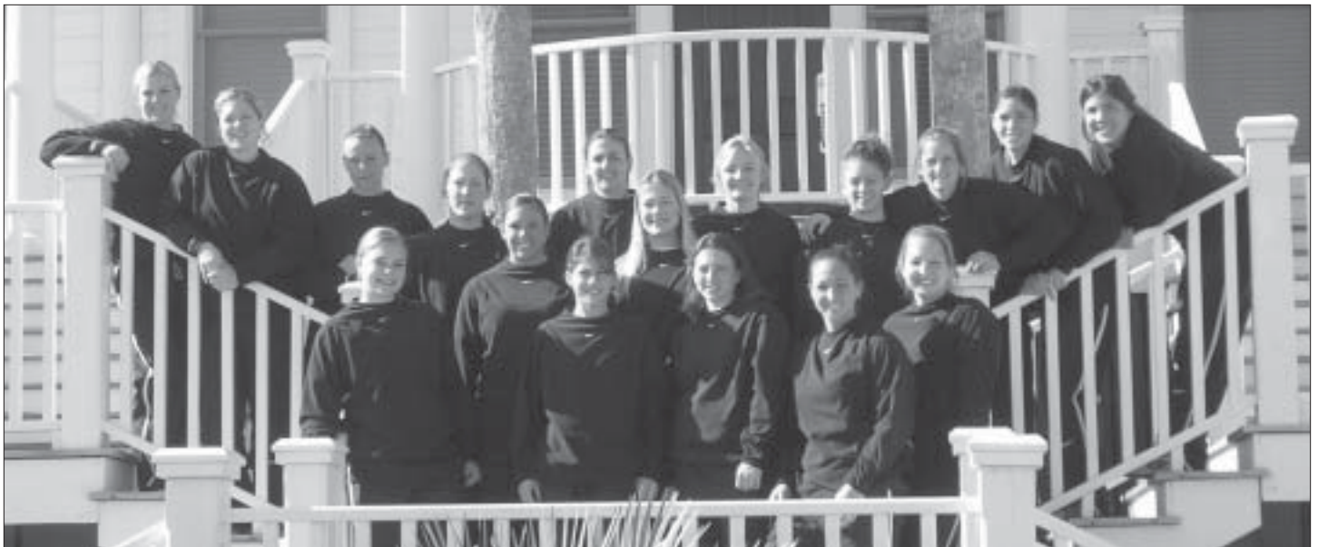
The 2005 Providence College Softball Team

BIG EAST/Aeropostale Scholar-Athlete Award Winner