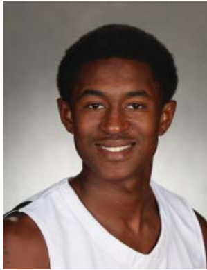
Marshon Brooks #2 Senior

G/F 6-5 200 Stone Mountain, Ga./Tucker High School '07