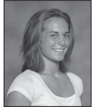
CAREER HIGHS Uneven Bars: 9.725 Balance Beam: 9.775

...Paced Pitt's beam squad against Kent State and Penn State with a mark of 9.725...Against Michigan State, scored 9.725 on bars, which tied her for fifth place in the event...She would later post another team-high score on beam with a third-place overall mark of 9.775. It marked the second time in as many meets that she posted a team-high score in an event...Tied for seventh against Florida on beam, with a team-high 9.675...Against Ohio State, placed second on beam with a 9.750...Also placed eighth on bars with a 9.600...Tied career-high 9.775 on beam, placing third against George Washington...Placed second on beam against WVU, tying her career-high 9.775...Registered a 9.700 on bars against Denver and Texas Woman's to grab a top-10 plaudit.