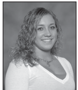
CAREER HIGHS Vault: 9.575 Floor Exercise: 9.775

...Scored a 9.100 on floor against Penn State and Kent State...Placed in the top-ten in the vault competition against Michigan State with a score of 9.550...Posted a top-ten score of 9.450 in the floor competition at New Hampshire...Placed fourth on floor exercise against Rutgers with a career high 9.725...Also placed eighth on vault with a 9.550...Against Florida, scored a 9.625 on the floor exercise and a 9.300 on vault, landing in ninth and eleventh, respectively...Tied career-high 9.550 on vault against Ohio State...Registered a career-high 9.575 on vault against George Washington, placing seventh overall...Set a career-high 9.775 on the floor exercise against WVU, tying for fifth...Placed fifth on floor against Denver and Texas Woman's with a mark of 9.775, tying her career high.