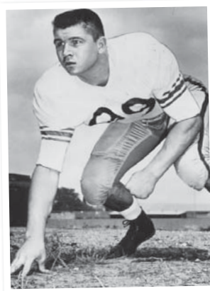
E Mike Ditka