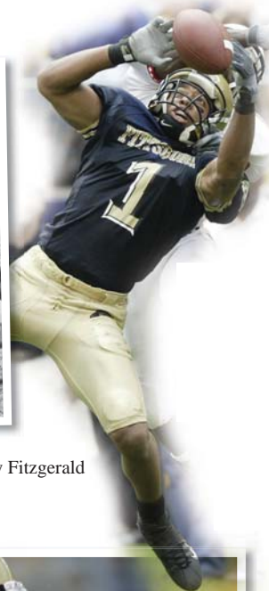
WR Larry Fitzgerald