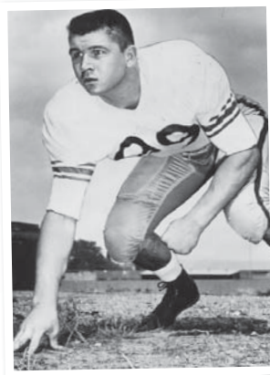
E Mike Ditka