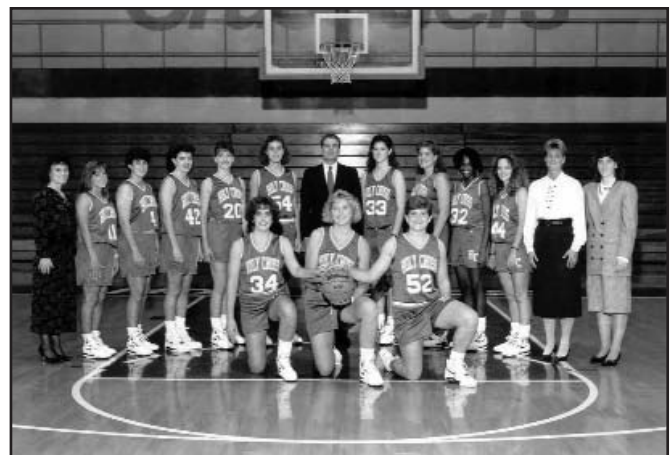
The 1990-91 Holy Cross women's basketball team defeated Maryland in the first round of the NCAA Tournament