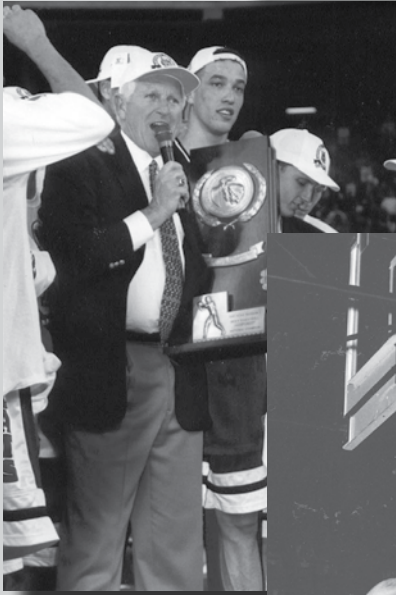
Lute Olson and the Arizona Wildcats captured the 1997 NCAA title.