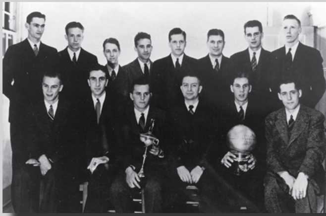
Oregon's "Tall Firs" won the first NCAA title in 1939.