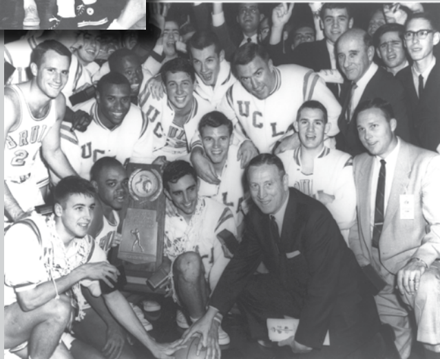
The 1964 UCLA Bruins, the first of the school's 11 NCAA Championship squads.