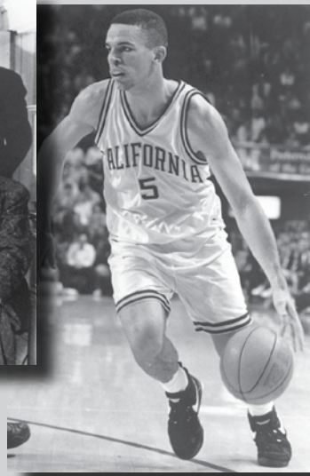
Jason Kidd, California