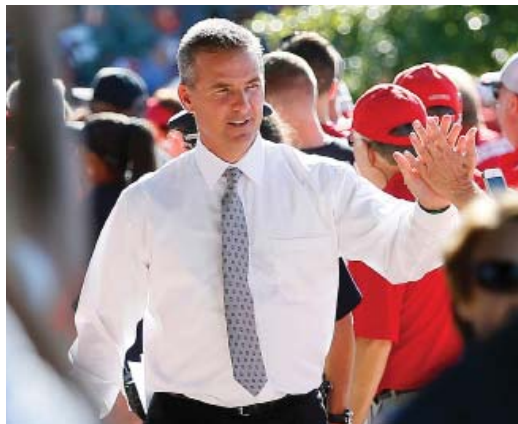
Urban Meyer is in his 16th season as a head coach. His .850 winning percentage (165-29) is highest among all active coaches with at least 10 years experience at a four-year school, and third highest all-time.