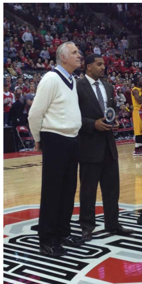
Jerry Lucas, left, and Jim Jackson both earned national player of the year recognition as Buckeyes. Lucas earned the honor twice.

*Final Four // (#) Seed // ## Results vacated by NCAA